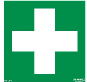
First aid station