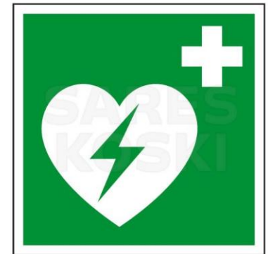
Automated external defibrillator