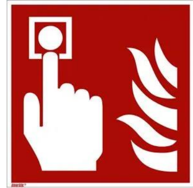
Fire alarm button